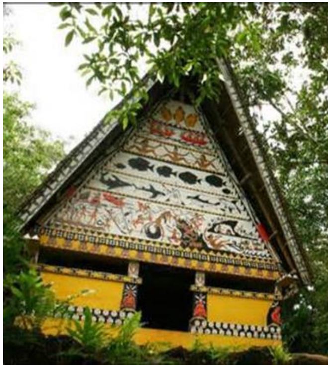
Figure 1 "Bai" – Traditional Chief's Meeting Building